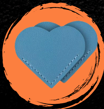
Colorful Leather Corner Bookmarks $1.00