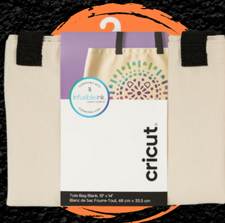
Tote Bag (2 sizes) $12.00 - $14.00