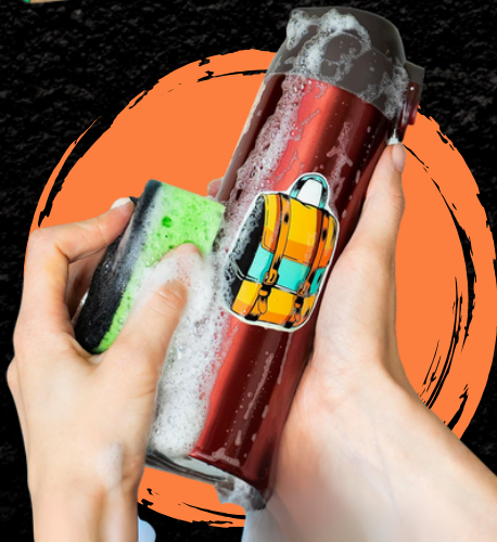
Sticker Paper $0.50