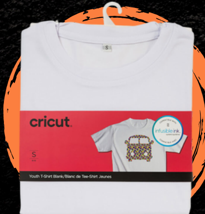
Youth T-Shirt $8.00