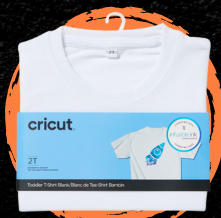
Toddler T-Shirt $8.00