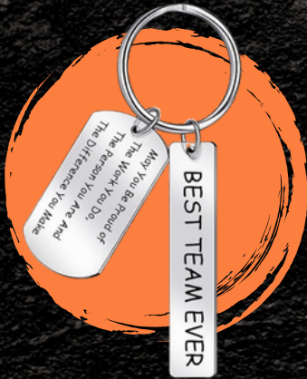
Metal Keychain $1.00