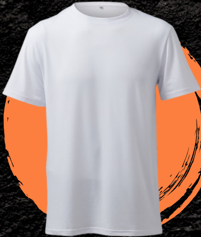
Crew-neck T-shirt $10.00