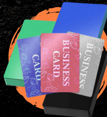
Metal Card Blanks $0.25