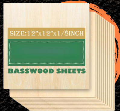
Basswood Sheet $1.50