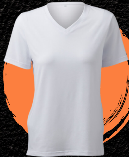
V-Neck T-Shirt $10.00