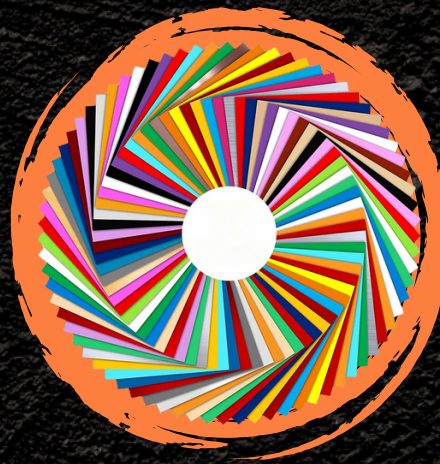
Adhesive Vinyl $0.50