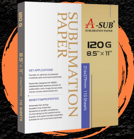
Sublimation Paper $0.15