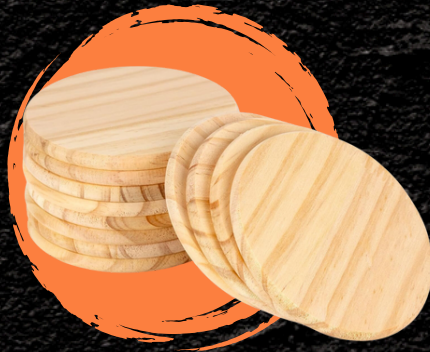
Wooden Coaster $1.00