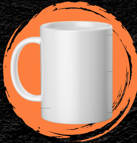
Ceramic Mug $4.00