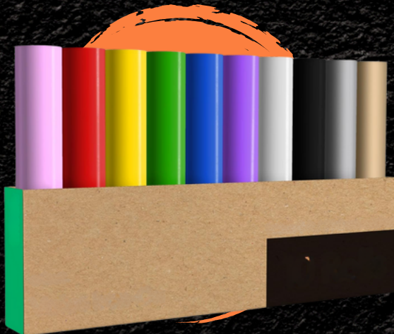
Iron-on Vinyl $1.50