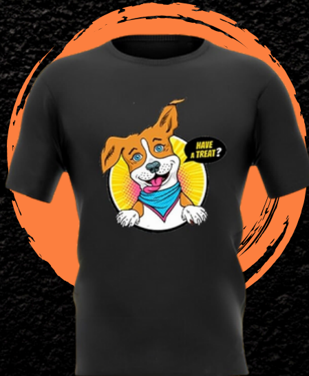
Iron-on for dark fabric $2.00